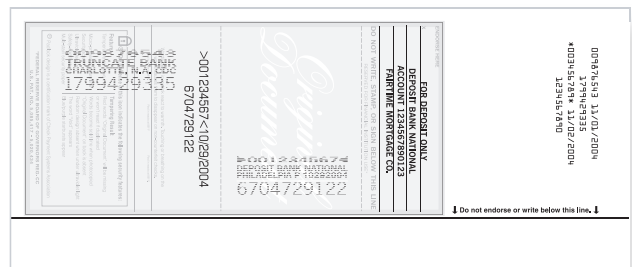
Back of a substitute check